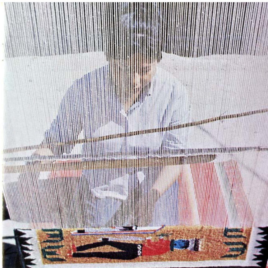
Figure 2. Shiprock Dedication Commemorative Brochure , September 6, [1969], lot X5184.2009, folder 102725169, Computer History Museum, Mountain View, CA.

shoulder, supervising and admiring her work (fig. 3). The text negotiates the transition from traditional artisanal cultural work to industrial wage labor by asserting that “building electronic