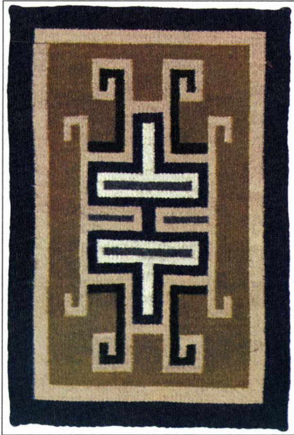
Figure 1. Shiprock Dedication Commemorative Brochure , September 6, [1969], lot X5184.2009, folder 102725169, Computer History Museum, Mountain View, CA.

a short paragraph: “Thank you for helping us celebrate the dedication of Fairchild Semiconductor’s new Shiprock facility—a partnership in progress.” 27