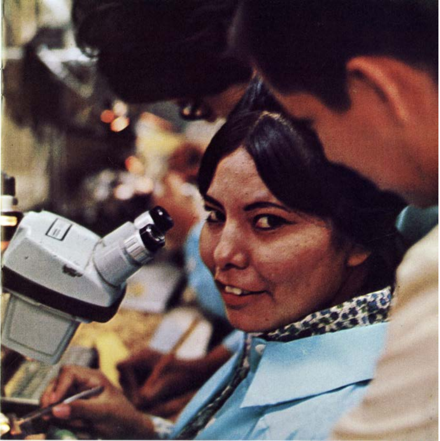
Figure 3. Shiprock Dedication Commemorative Brochure , September 6, [1969], lot X5184.2009, folder 102725169, Computer History Museum, Mountain View, CA.

merely a different material iteration of the same pattern or aesthetic tradition found within the integrated circuit. The opposing page states, “The blending of innate Navajo skill and Semiconductor’s precision assembly techniques has made the Shiprock plant one of Fairchild’s best facilities—not just in terms of production but in quality as well.”